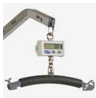
Scale If required, a scale is available approved. According to the medical standard EN 45501, certified and sealed in order to be used to medicate.