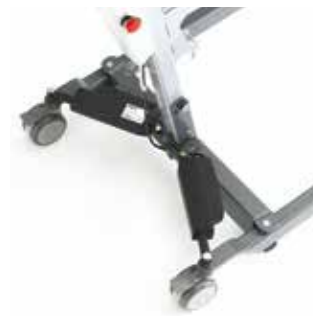
Electrical leg spread Available for Invacare Birdie (option).