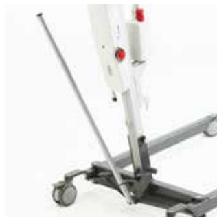
Handle for leg spread Handle can easily be attached to operate the manual leg spread.