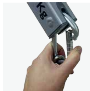
Click on spreader bar Easy to change the spreader bar.