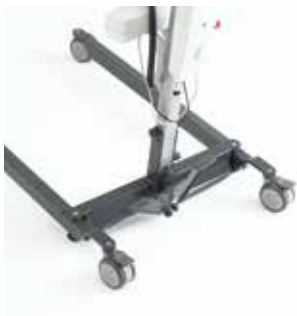
Manual leg spread Simply step on the pedal to adjust the leg spread.