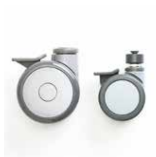
Castors 100 mm or 75 mm castors available. (braking castors are shown)