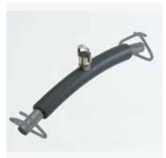
2 point quick release spreader bars Easy to attach and detach. Available widths: 350 mm, 450 mm, 550 mm.