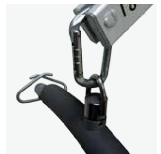
Mounted spreader bar Correctly and safe positioning of the spreader bar.