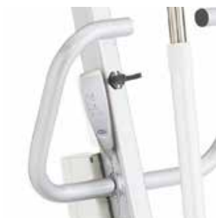
Push bar and hand control Superior ergonomics for carers.